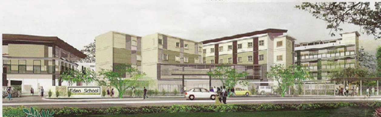
PROPOSED EDEN SCHOOL @ BUKIT BATOK WEST AVENUE 3

krish.phua@autism-association.org.sg, 或电话 6774 6649。请帮助我们为忆恩学校的学生创造更美好的明天！