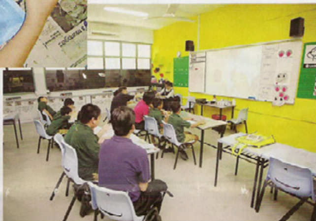
Art lesson conducted in class