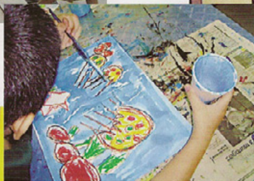
Nurturing creativity through drawing