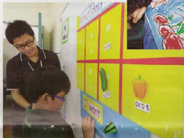
A lesson in maths