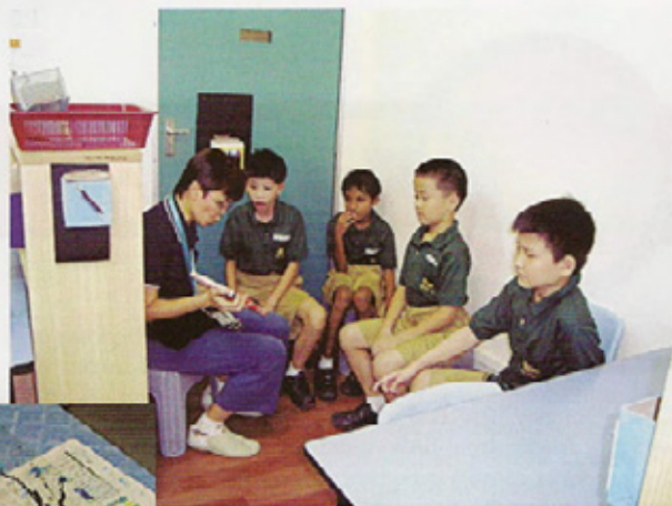
Social skills in play