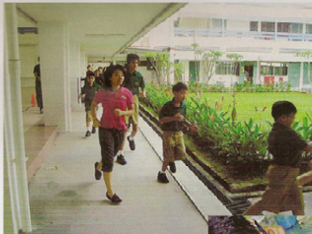
Jogging as part of the PE lesson